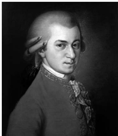
Wolfgang Amadeus Mozart

A chamber orchestra, rather than a bigger symphony orchestra, offers a balance with tonight's soloist that's probably closer to what Mozart himself had in mind when he wrote the piece.