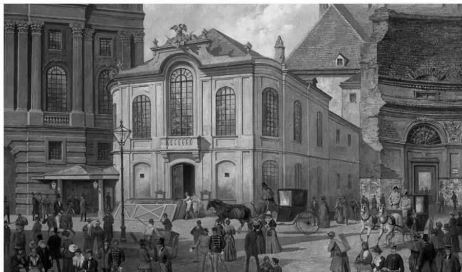
The Burgtheater in Vienna, where both of tonight's Mozart piano concertos were premiered.