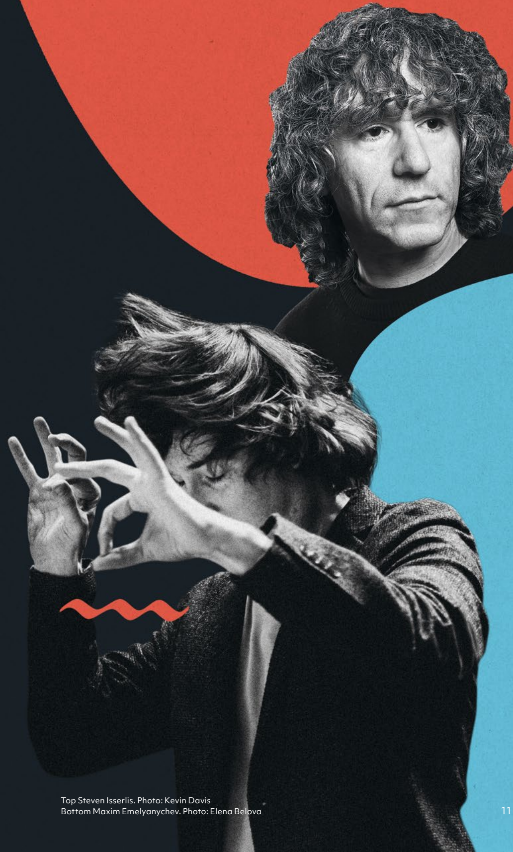
Top Steven Isserlis. Bottom Maxim Emelyanychev.