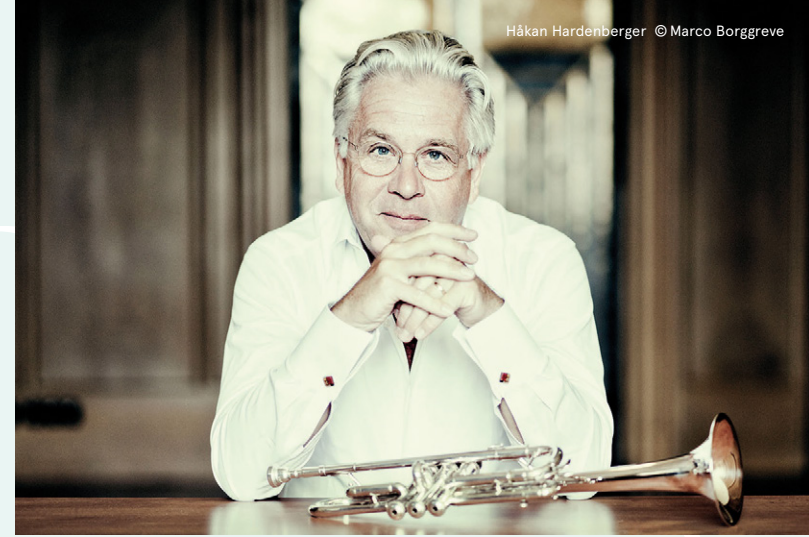
Håkan Hardenberger